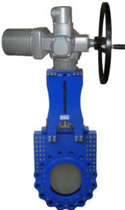
XDM-HP Bi-directional high pressure KGV, resilient (NBR) seated electric actuator rising stem