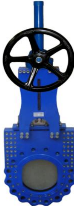
XDVR-HP Bi-directional high pressure KGV, resilient (NBR) seated manual rising stem and gearbox