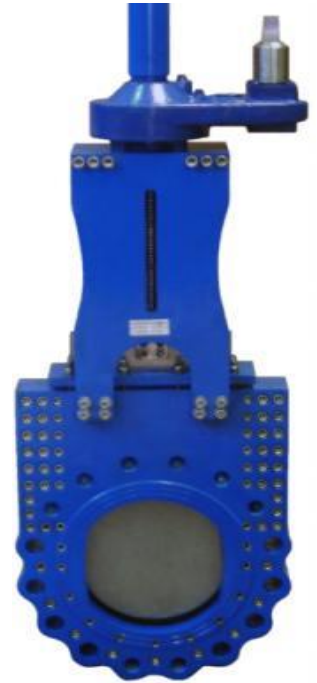
XDCCR-HP Bi-directional high pressure KGV, resilient (NBR) seated square cap and gearbox