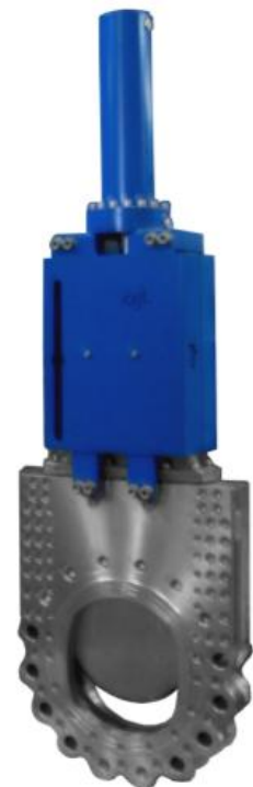
XDH-HP Bi-directional high pressure KGV, resilient (NBR) seated hydraulic actuator