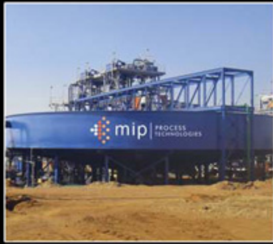
26m \phi Thickener in operation