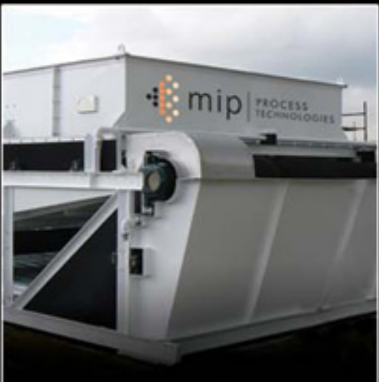
30m 2 Linear Screen