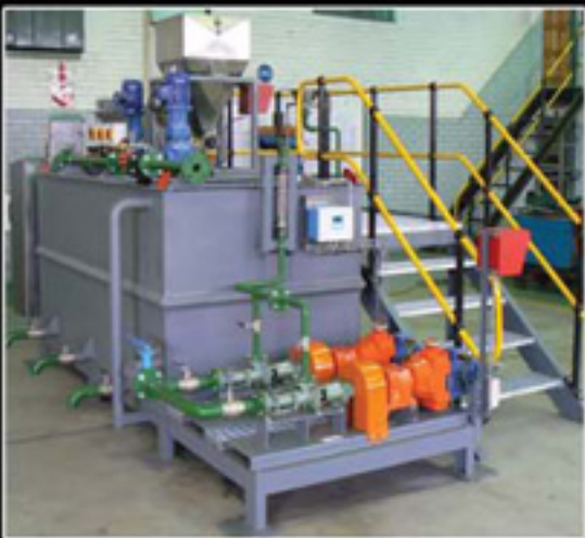
MIP-200 Flocculant Plant