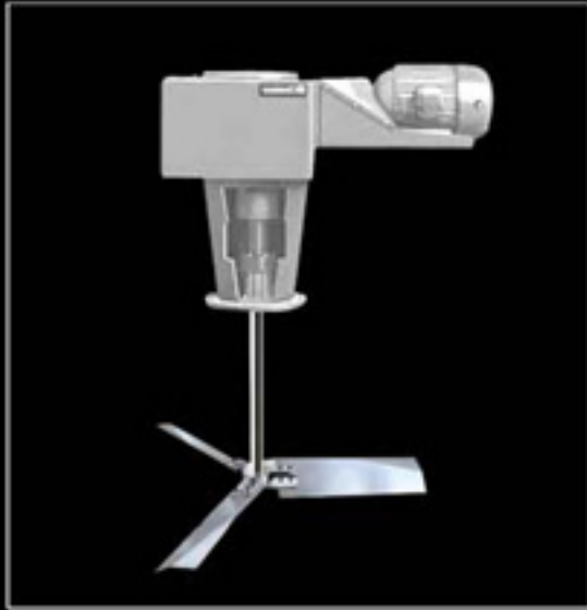
Chemineer HT Agitator