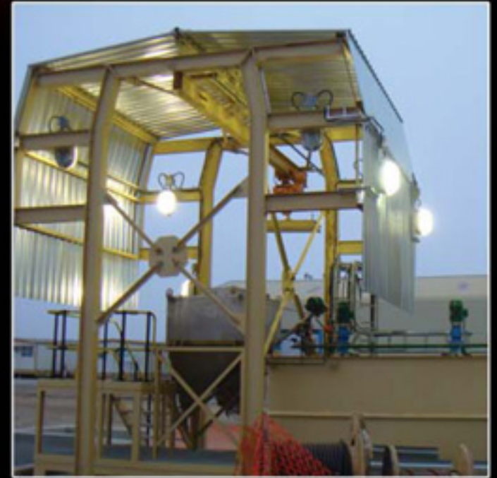
Flocculant Plant with hoist

Tanks can be supplied in a variety of materials and designs. We employ Chemineer mixers and Moyno pumps on all our flocculant plants.