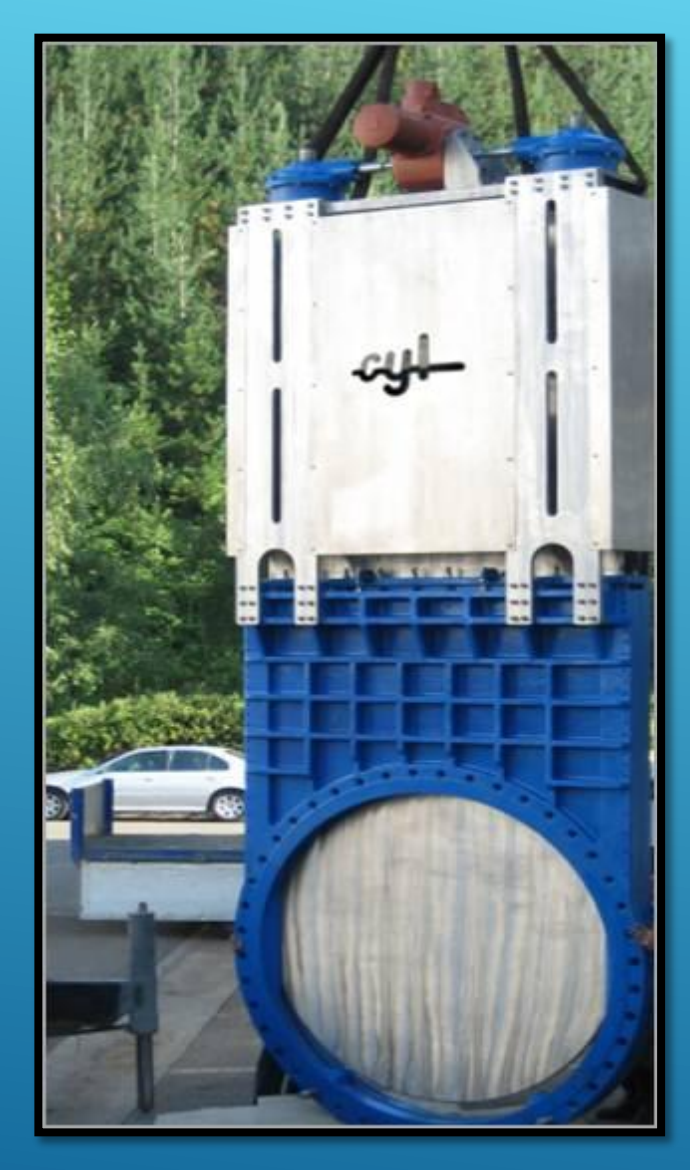
DN-1800 – 2,5 BAR -SANTOS CITY- COMPANY SABEPS-CLOSED BRASIL - WASTEWATER