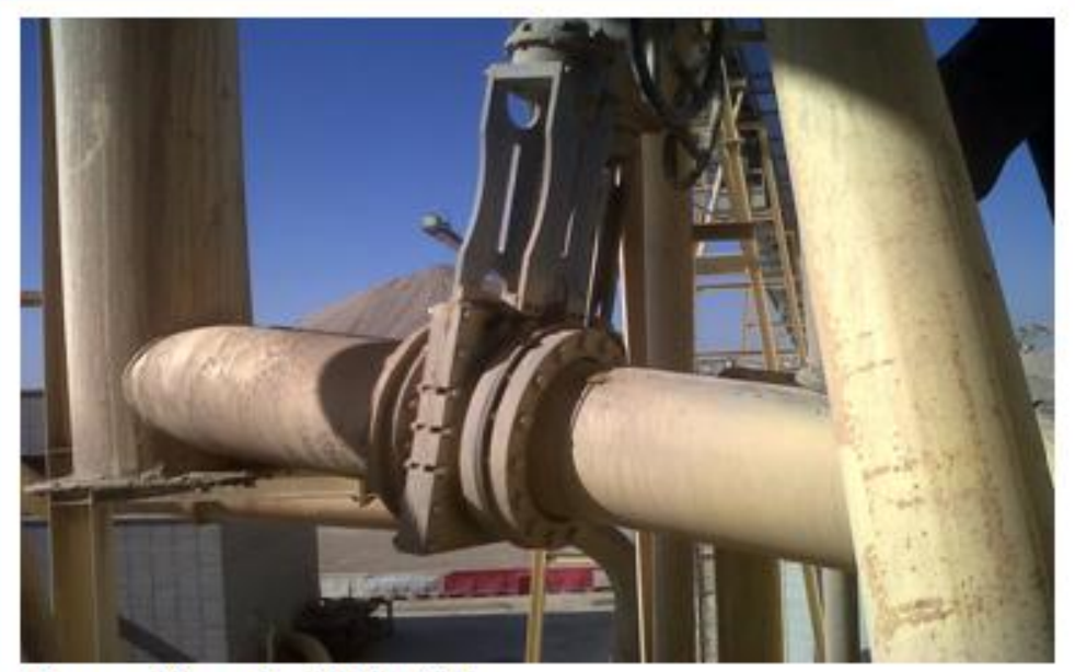
Copper mining, valve DN250, Chile